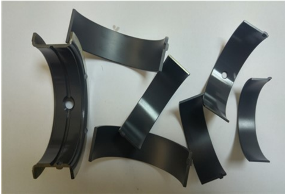
Fig.1 King Polymer Coated Bearings

Polymer coatings developed by King Engine Bearings are composed of different types of inorganic and ceramic additives dispersed in a polymer matrix. The additives have nano-dimensions. Therefore, the coating material may be defined as a polymer ceramic nano-composite.