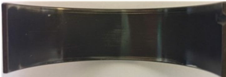
Fig.4 King Steel-Aluminum Bearing Coated with K-40 After Direct Friction Test

K-40 is a soft version of coating. It is sacrificial, with excellent conformability and anti-friction properties. This coating composition was designed especially for engines experiencing continuous metal-to-metal contact. This is characteristic of the extreme loading and conditions found in drag racing. The image of a bearing tested under continuous direct contact with the journal is depicted in Fig.4.